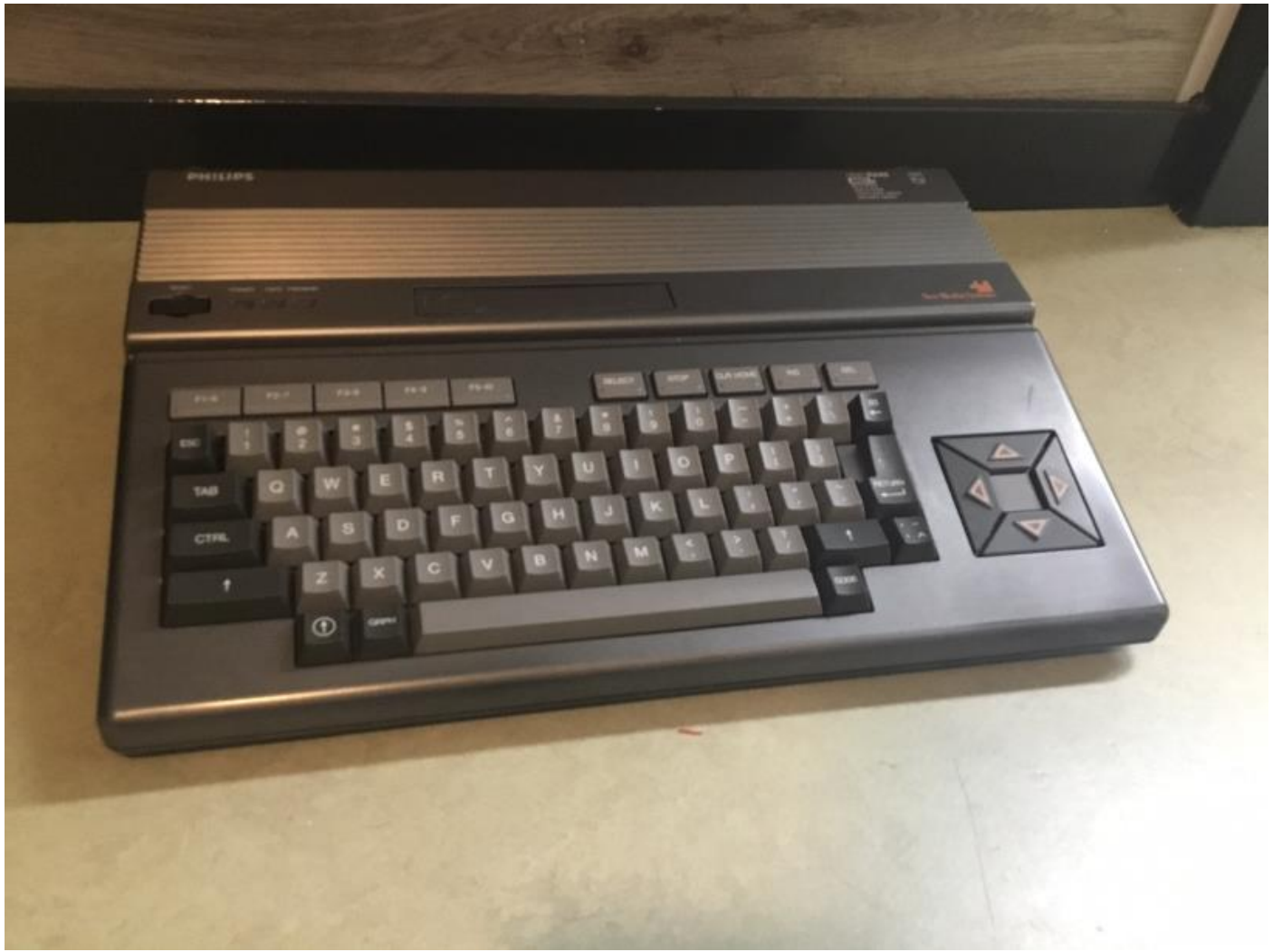
The Philips NMS 8245 MSX-2 computer.